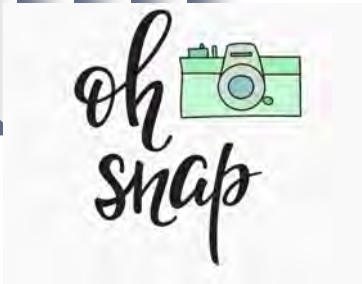
A & W Cruise May 6, 2023